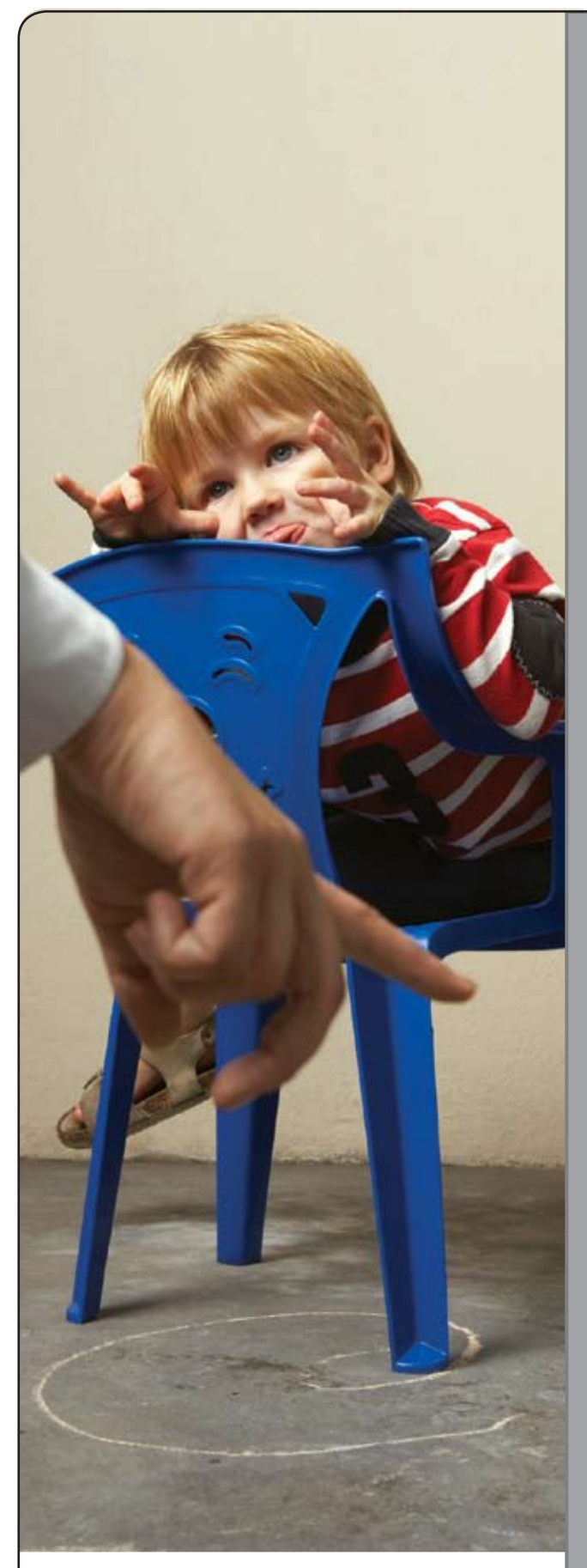
Early Childhood Learning Knowledge Centre c/o Centre of Excellence for Early Childhood Development GRIP-Université de Montréal P.O. Box 6128, Centre-ville Stn. Montreal, Quebec H3C 3J7 childhoodlearning@ ccl-cca.ca www.ccl-cca.ca/childhoodlearning